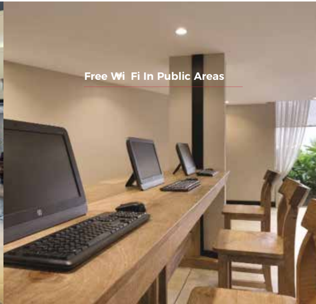
Free Wi Fi In Public Areas