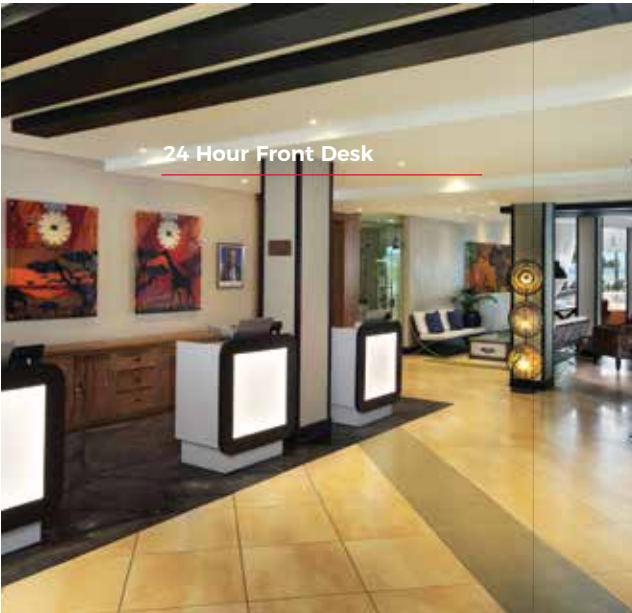
24 Hour Front Desk

Beachfront Location, Outdoor Pool And Children's Pool, Private Beach, Multiple Meeting Venues, Travel Desk Assistance , Multiple Dining Options, Free Wi-fi In Public Areas, Fitness Center, 24-hour Front Desk, On Site Parking, Gift Shop, 24 Hour Business Center.